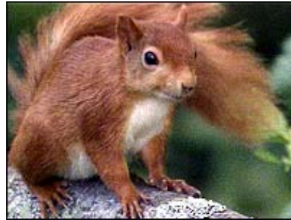
The red squirrel exists in some isolated areas in Wales

Conservationists believe Wales may have its own "pure" race of red squirrels.