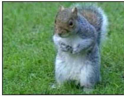
The grey squirrel competes with the red for food

Posters, explaining the plight of the reds, are being put up in the survey areas to raise awareness of the project and to ask people to let the Wildlife Trust know if they see any red squirrels.